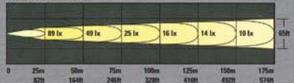
GOLIGHT® LUX FACTORS