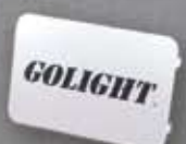
STRYKER™ ROCKGUARD 15305 (white), 15306 (black)