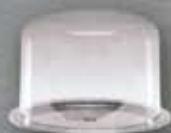
SECURITY DOME 17920