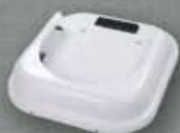
PERMANENT MOUNT SHOE Gray (15201), White (15202), Black (15203)