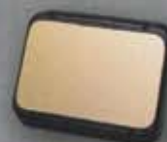
COVERT INFRARED LENS 15007