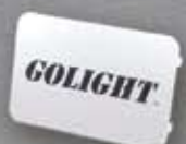
ROCKGUARD COVER 15304 (white), Also Available in Black