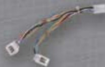
DUAL CONTROL X-SPLITTER (Operating 1 Light with 2 Remotes) 2020-X, 2049/67-X