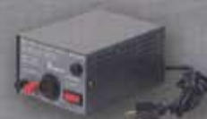
REGULATED DC POWER SUPPLY 1204