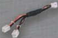
DUAL STATION Y-SPLITTER (Operating 2 Lights with 1 Remote) 2020-Y, 2049/67-Y