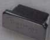
PROFILER™ EXTRA BATTERY PACK 8121