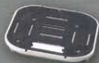
MAGNETIC MOUNT SHOE Gray (16300), White (16301), Black (16303)