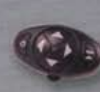
STRYKER™ DASH-MOUNT WIRELESS REMOTE 30200 Compatible with all Wireless Units