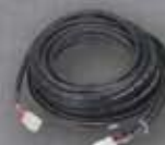
EXTENSION CORDS 2020 MODELS - 10' (2020-10), 20' (2020-20) 2049/67 MODELS - 10' (2049/67-10), 20' (2049/67-20)