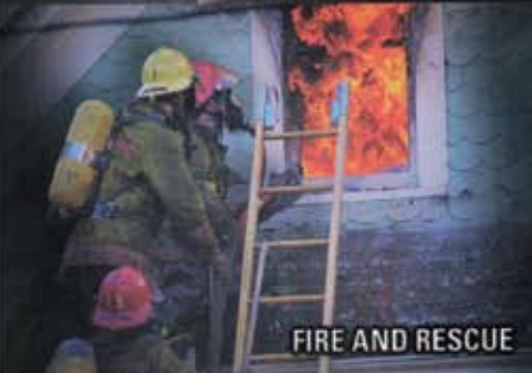
FIRE AND RESCUE