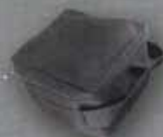
HEAVY NYLON CARRYING CASE 18000