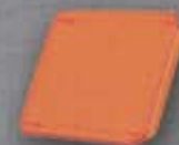
AMBER SNAP-ON LENS 15303