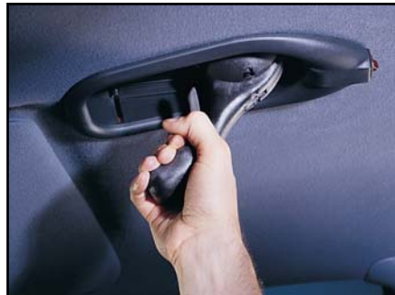
To operate Questar, pull the handle down