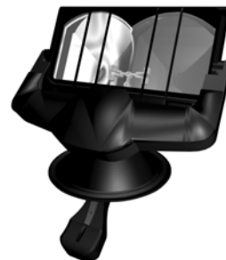
Part Number CD-QS-3 & CD-QS-4