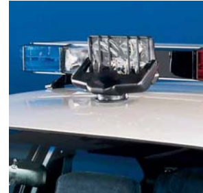
Questar shown in its operating position.