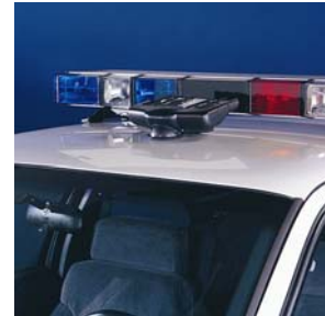
Questar shown in its stored position.