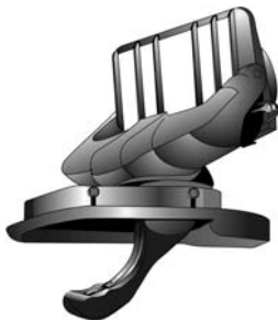
Part Number CD-QS-1 & CD-QS-2