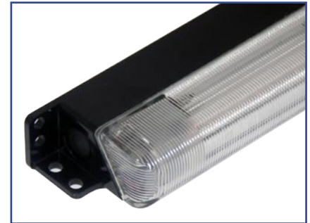
High quality lens will not yellow or break under normal impact.