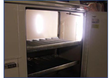
Can be mounted horizontally or vertically. Slim profile designed to fit into tight spaces.