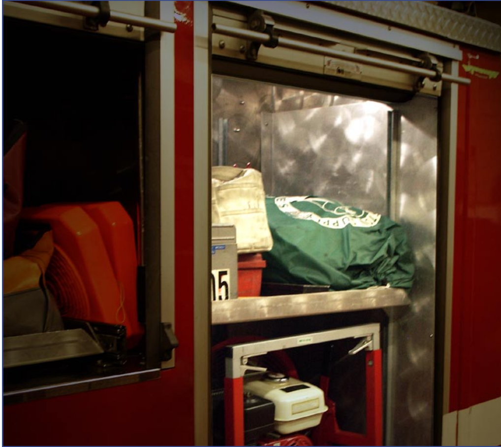
Perfect for roll-up door, interior cab, and storage compartment applications.