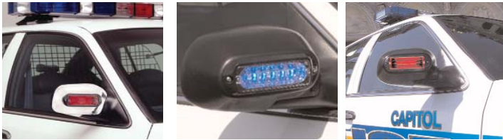
LIN6 Mirror Beam in white housing

* Replace symbol in model number with letter indicating lens or LED color desired (driver side, passenger side): A = Amber; B = Blue; C = Clear; G = Green; R = Red.