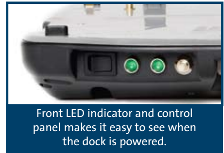
Front LED indicator and control panel makes it easy to see when the dock is powered.