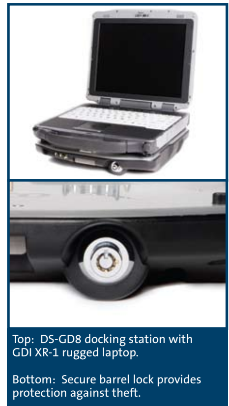
Top: DS-GD8 docking station with GDI XR-1 rugged laptop.