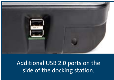
Additional USB 2.0 ports on the side of the docking station.