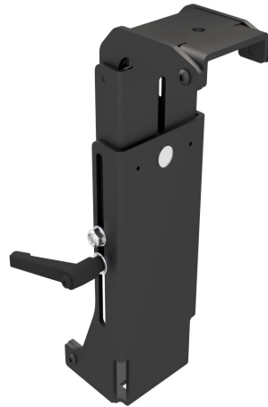
BaseLine vertical pedestal (Front View)