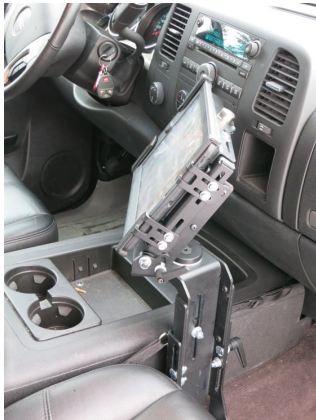
BaseLine pedestal shown with universal tablet cradle mounted on dual pivot arm mount