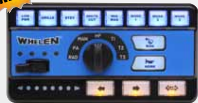
CCSRN36 CCSRNT36 CCSRN3F CCSRNT3F