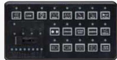
CCSRN3 CCSRNTA3 CCSRN3A CCSRNT3A