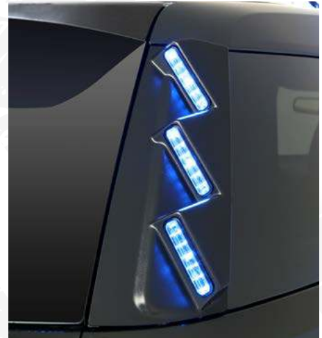
Ford Police Interceptor Utility