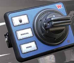
Remote Control Unit