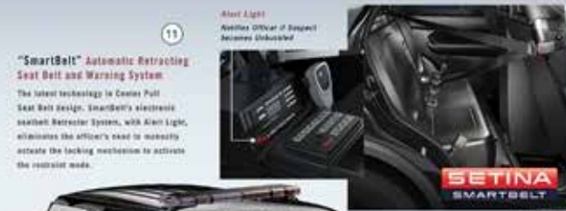
Alert Light Multiple Officer of Suspect Arrested Unlocked

DEM Replacement or "CarbonFit" Seat Cover Transport Systems Setina's Center Pull Seat Belt Systems are Professionally Designed and Laboratory tested to meet the rigorous 2012/10 FMVSS Seat Belt Standards.