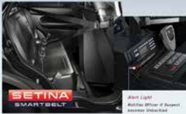
Alert Light Multiple Officer of Suspect Arrested Unlocked