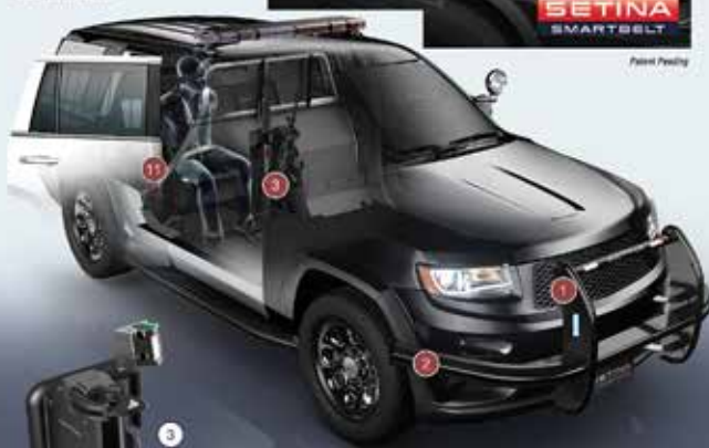
3 Shown with "VaultLock" Firearms Mounting System

450L "LED" Lighted Push Bumpers The latest technology in push bumper design. The integrated LED lights are recessed into the push bumper for front end lighting placement and light protection.