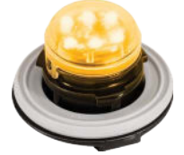
VXE Omnidirectional Hideaway Twist-In Mount