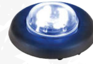
VXE Omnidirectional Grommet Mount