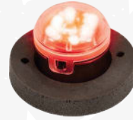
VXE Omnidirectional Hideaway Mount