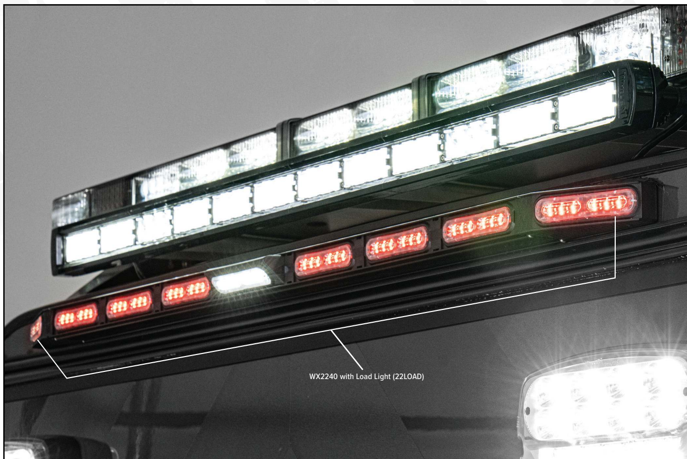
WX2240 with Load Light (22LOAD)

WeCanX 2250 is 50% slimmer than our 4500 Series, provides warning options, and offers aerial recognition options. Choose from flat end caps, angled end caps which create a multi-angled light spread, or a mix of both. The WeCanX 2250 is also available with a load light option which projects light down to increase visibility while loading cargo. Slide-in assembly allows lightheades to be easily removed for customization and field serviceability. Whelen Command ® enables endless configurations, and lighthead placements are easily arranged within WeCad™.